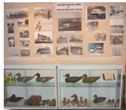
Gun Clubs & Ned Burgess display