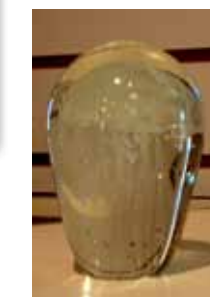
Jellyfish in glass is new to our gift shop