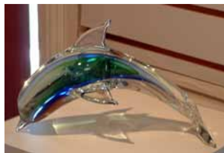
Glass Dolphin in our Gift Shop