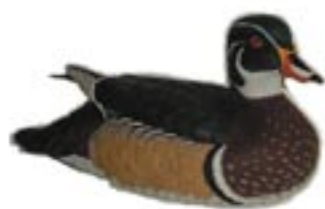
Raffle tickets for a full-size decorative Wood Duck carved and painted by Al Brandtner are still available.