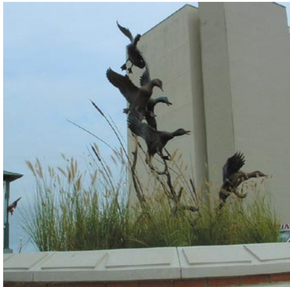
Photos of the wildfowl sculpture following the recent landscaping

Don't forget our quarterly meeting on Wednesday, October 11th at the Museum at 7pm. We will be electing a new President, Secretary and Field Trip Coordinator. See you there!