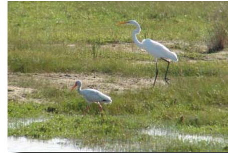
White Egret and White Ibis at Back Bay