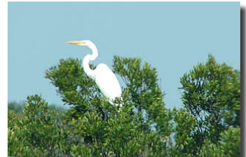
White Egret in tree.

**Make sure you also put our newsletter email address into your contact area so your newsletter doesn't end up in your spam folder.