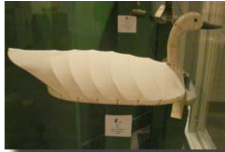
Canvas Swan on display in the main gallery

“CHESAPEAKE BAY DECOYS” EXHIBIT February 27, 2009 - August 31, 2009