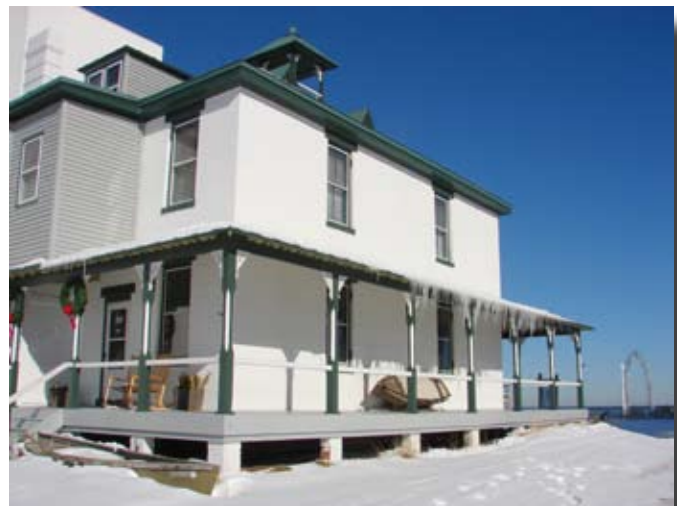
Atlantic Wildfowl Heritage Museum in the snow and ice.