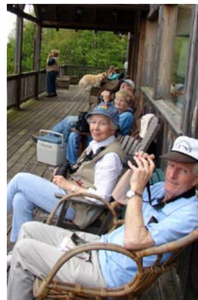
Porch birders at Bear Mountain Wilderness Retreat

Our Guild picnic will be WEDNESDAY, JULY 18TH at Redwing Park in Virginia Beach and our theme is "Minimum Work-Maximum Fun". Redwing Park is located off General Booth Blvd. near the Oceana Blvd. intersection (From the Museum it is located on the left side of the road. From the Oceana exit off 264 turn right onto General Booth Blvd and turn left into the park entrance). After entering the park make your first right hand turn and proceed to Shelter 5.