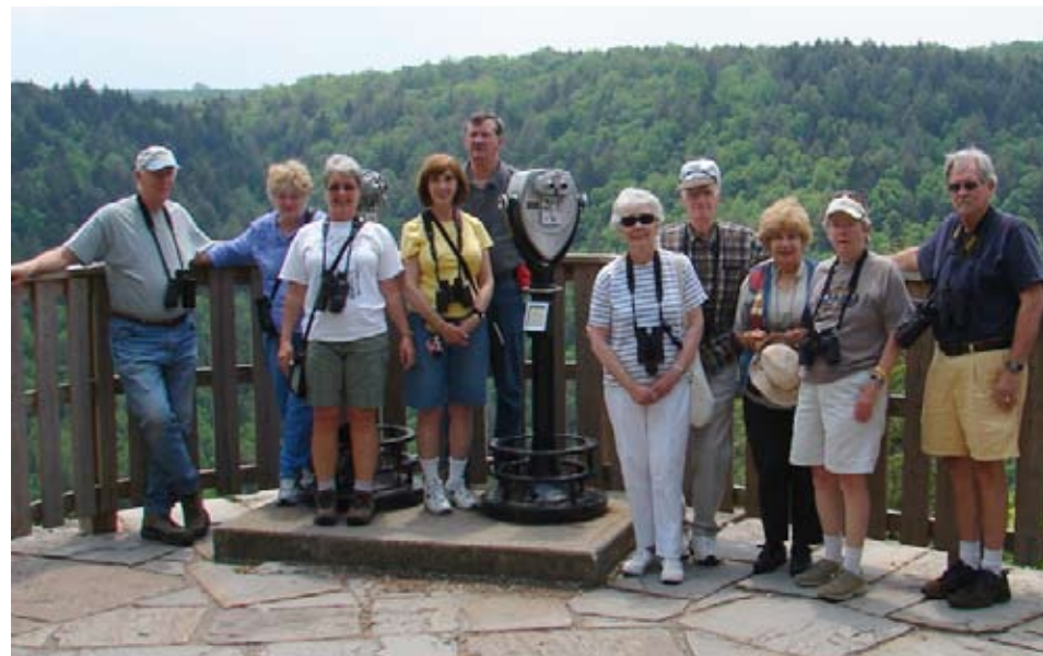
BBBC at Blackwater Falls

Published by the Atlantic Wildfowl Heritage Museum at the deWitt Cottage 1115 Atlantic Avenue Virginia Beach, VA 23451 (757) 437-8432 atlanticwildfowl@rcn.com AWHM.ORG Under the auspices of: The Back Bay Wildfowl Guild, Inc. (A not for profit organization)