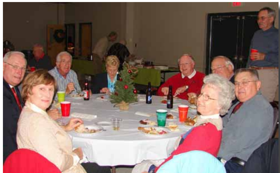
“Enjoying the Christmas auction”

Parking is available at the Raven Restaurant across the street and the Newcastle Motel next door for members during meetings and gatherings at the cottage.