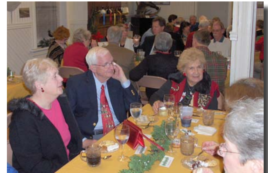
A good time was had by all at the Guild's annual Christmas party.