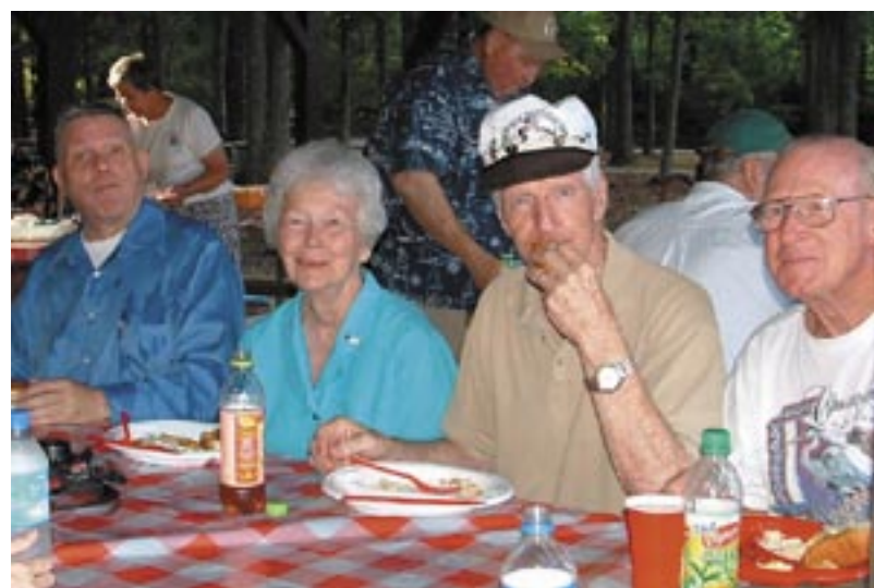
Good Food, Good Friends!